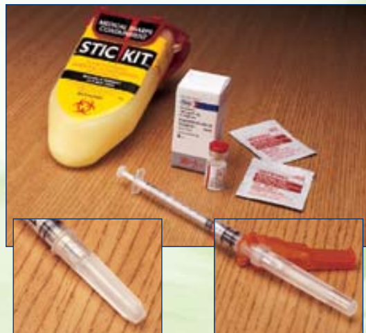
NEEDLE WITHOUT NEEDLEGUARD